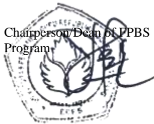
Chairperson/Dean of PPBS Program