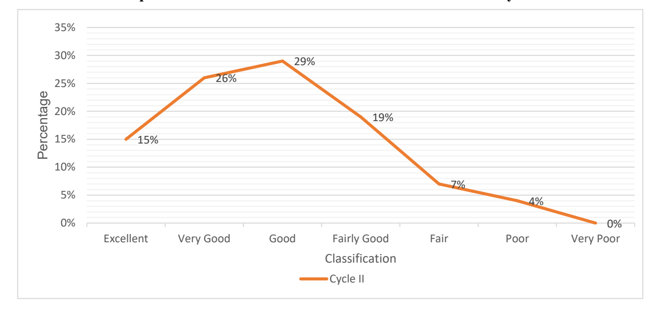
Graphic 2. The Result of the Students' Performance in Cycle II

It was evident from this outcome that the first-grade children at SD Pangudi Luhur Don Bosko Semarang were able to master vocabulary through the use of flashcards. Because the outcome met the researcher's expectations, the study was completed, and a report would be produced.