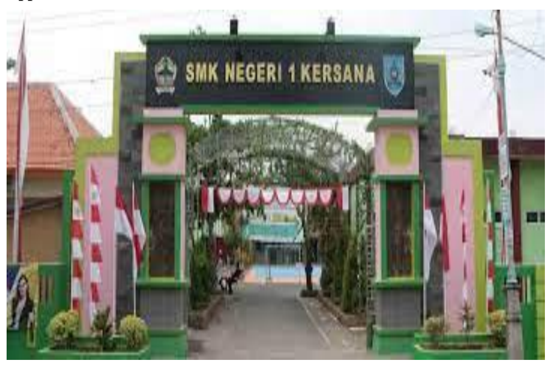
Appendix 13: Documentation